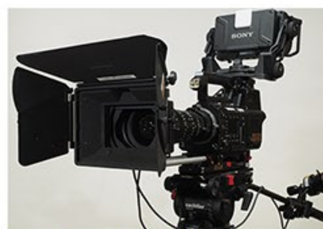
Sony F55 4K Camera